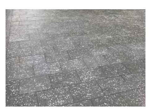
Ebony Pebble Honed Finish