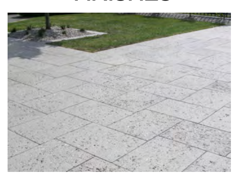
Mist Pebble Exposed Finish