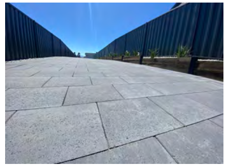
Ebony ECO Smooth Finish